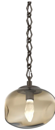
Shown in flat bronze / bronze geo

PRODUCT DIMENSIONS . . . . . Min/Max Adjustable Overall Height: 14.5" - 69.5" COLOR RENDERING . . . . . 93 CRI LAMP COLOR . . . . . 3000K LUMENS/WATT . . . . . 70.00 LUMINOUS FLUX . . . . . 420 lumens