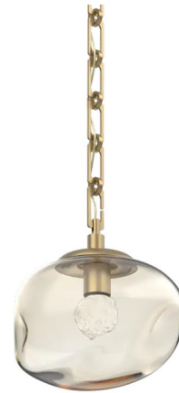
Shown in gilded brass / amber floret

PRODUCT DIMENSIONS . . . . . Min/Max Adjustable Overall Height: 14.5" - 69.5" COLOR RENDERING . . . . . 93 CRI LAMP COLOR . . . . . 3000K LUMENS/WATT . . . . . 70.00 LUMINOUS FLUX . . . . . 420 lumens