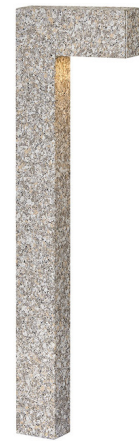
Shown in stone grey / etched glass

LAMP LIFE . . . . . 25000 hours COLOR RENDERING . . . . . 80 CRI LAMP COLOR . . . . . 2700K LUMENS/WATT . . . . . 100.00 LUMINOUS FLUX . . . . . 150 lumens