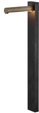
Shown in black / burnished bronze