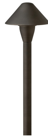
Shown in brass satin black / clear

LAMP LIFE . . . . . 25000 hours COLOR RENDERING . . . . . 90 CRI LAMP COLOR . . . . . 2700K LUMENS/WATT . . . . . 100.00 LUMINOUS FLUX . . . . . 150 lumens