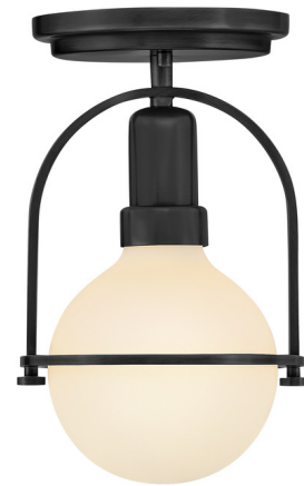
Shown in black / etched opal

PRODUCT DIMENSIONS . . . . . Downrods Included: (1) 6" and (2) 12" Stems