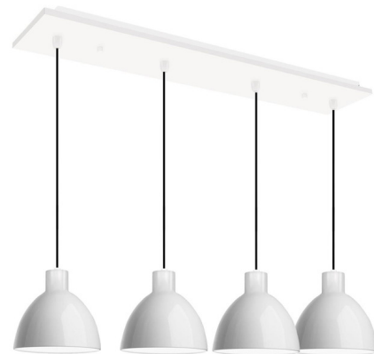
Shown in glossy white / white

PRODUCT DIMENSIONS . . . . . Adjustable Cable Lengths: 120" LAMP LIFE . . . . . 50000 hours COLOR RENDERING . . . . . 90 CRI LAMP COLOR . . . . . 3000K LUMENS/WATT . . . . . 42.32 LUMINOUS FLUX . . . . . 1608 lumens