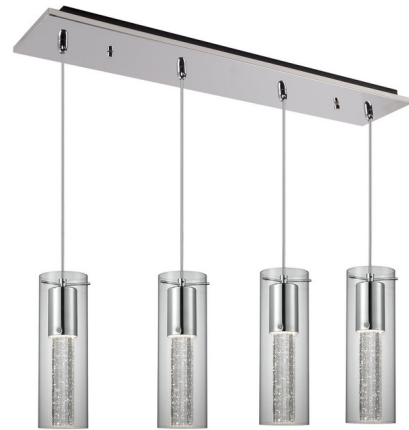
Shown in chrome / clear

The Champagne Linear Multi Light Pendant brings a decorative look to your interior space. The smooth frame holds individual clear glass surrounding cylinder a of crystal bubbles that casts warm, inviting shadows throughout your room. Adjust each cable to create your own unique look.