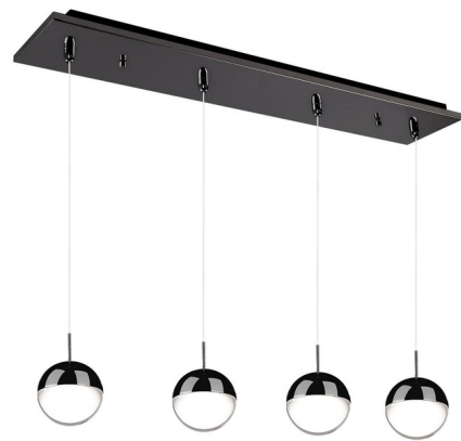
Shown in black chrome / clear / white

PRODUCT DIMENSIONS . . . . . Adjustable Cable Lengths: 120" LAMP LIFE . . . . . 50000 hours COLOR RENDERING . . . . . 90 CRI LAMP COLOR . . . . . 3000K LUMENS/WATT . . . . . 58.59 LUMINOUS FLUX . . . . . 1992 lumens