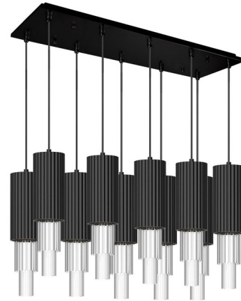
Shown in matte black / clear ribbed

PRODUCT DIMENSIONS . . . . . Adjustable Cable Lengths: 120" LAMP LIFE . . . . . 50000 hours COLOR RENDERING . . . . . 90 CRI LAMP COLOR . . . . . 3000K LUMENS/WATT . . . . . 31.33 LUMINOUS FLUX . . . . . 3290 lumens