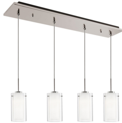
Shown in brushed nickel / clear/ opal

The Verona Linear Multi Light Pendant introduces a refined minimalism to your interior space. Featuring a sleek frame accented with steel detailing at the top, encases a cylindrical design of inner opal glass and outer clear glass. The result is a soft, warm glow that gently illuminates the room with elegant, ambient shadows. Adjust each cable to create your own unique look.