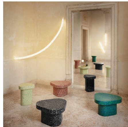
Shown in natural

The Tratti Arc Wall / Ceiling Light is a sculptural work of art. Characterized by a slightly grainy white finish, noticeable even when turned off, and made of 3D printed nylon powder, this light produces a soft and diffused illumination that showcases the unusual geometry of the modular sections. Phase cut dimming. Backplate for standard US junction box is included. Note: Note: Includes a remote driver which must be placed in an accessible location.