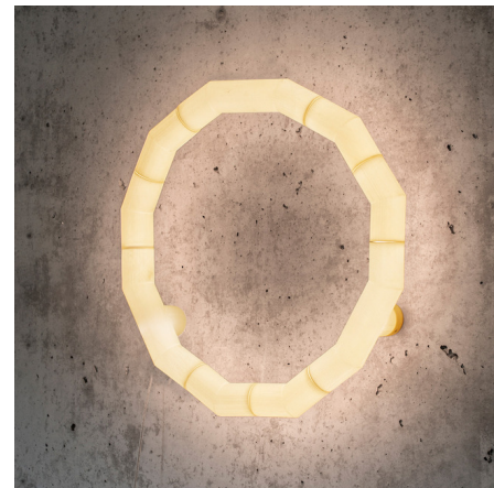
Shown in natural

The Tratti Round Wall / Ceiling Light is a sculptural work of art. Characterized by a slightly grainy white finish, noticeable even when turned off, and made of 3D printed nylon powder, this light produces a soft and diffused illumination that showcases the unusual geometry of the modular sections. Phase cut dimming. Backplate for standard US junction box is included. Note: Includes a remote driver which must be placed in an accessible location.