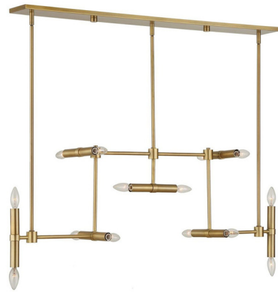
Shown in brass

PRODUCT DIMENSIONS . . . . . Downrods: 9x12", 3x6"