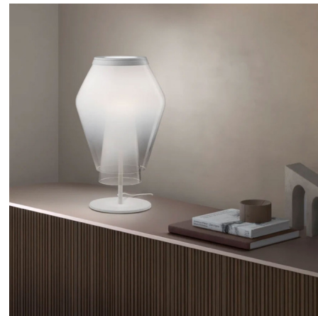
Shown in white / white

The Anisette Table Lamp features a double-layered glass shade that transitions from opal white to clear, inspired by the chemical effect seen when anise liqueurs are diluted with water. Both shades can be flipped upside down, allowing for 4 different configurations where the opal portions of the glass can either overlap or contrast to change the lighting effect. On/off switch located on cord.