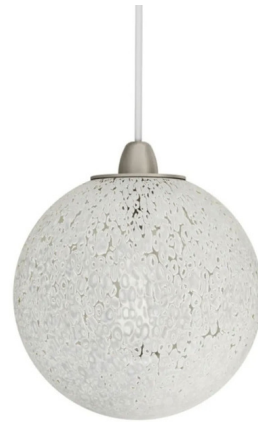
Shown in matte steel / white

The Rina Pendant is inspired by dandelions with its spherical shape and unique lighting effect. The glass is made using a murrine effect, a traditional technique that creates a pattern of translucent white dots and clear spaces. As light passes through the glass, a dazzling pattern of light and shadow is cast upon the pendant's surroundings.