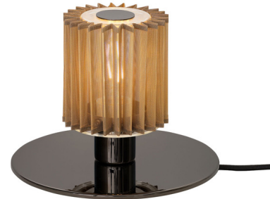
Shown in black / gold

When viewed from above, the In The Sun Table Lamp recalls the shape of the sun with its pleated cylindrical shade made of metal mesh. The shade houses the lamp's bulb, which casts a dazzling display of light and shadow onto its surroundings. In the Sun's simple, petite design will complement a variety of decor styles from classic to contemporary. Dimmer switch located on cord.