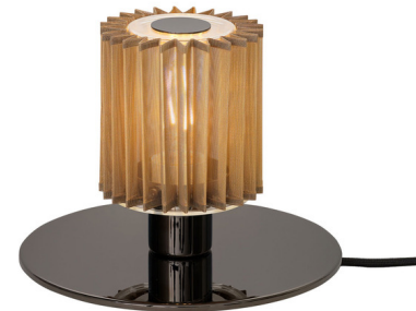
Shown in black / gold

PRODUCT DIMENSIONS . . . . . Cord Length: 98.4"