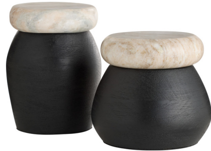
Shown in ebony

The Noelle Containers is inspired by ancient pottery. The curved, mango wood containers are topped with marble lids. Perfect for storing your treasures.