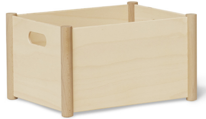
Shown in matte beech lacquer

The Pillar Storage Box is a multipurpose and distinctive storage container. The corners are formed of solid dowels that allow for the easy stacking of multiple boxes. Each box is able to hold considerable weight and it is possible to stack as many as desired. Use the finely crafted box lid, sold separately.