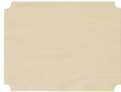
Shown in matte beech lacquer

The Pillar Storage Box Lid is for use with the Pillar Storage box. The beech plywood shape is cut to fit around the four corner dowels, balancing perfectly on top.