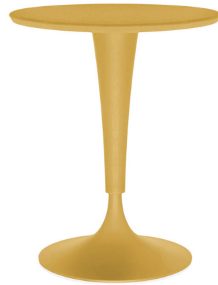
Shown in mustard

The Dr. Na Table is the perfect round cafe table for any outdoor door patio or seating area. Available in a wide array of shades, choose a statement-making vibrant color or muted tone to match any style.