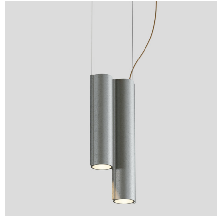
Shown in tumbled aluminum

The Silo 2SC Pendant offers a theatrical but sleek look thanks to its array of extruded aluminum cylinders. Silo's curving shape creates a rhythmic expression that adds a contrast to the pendant's rigid aluminum construction. Silo is available with downlights only, or with 2 downlights and a single uplight to create a dramatic lighting effect. ELV / 0-10V dimmable.