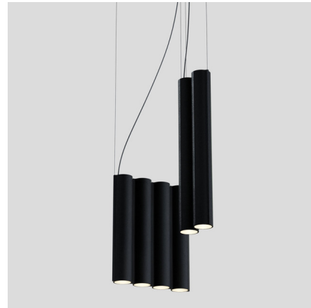
Shown in textured black

The Silo 10 Multi Light Pendant offers a theatrical but sleek look thanks to its array of extruded aluminum cylinders. Silo's curving shape creates a rhythmic expression that adds a contrast to the pendant's rigid aluminum construction. In this composition, multiple pendants are suspended together to create an intriguing display. ELV / 0-10V dimmable.