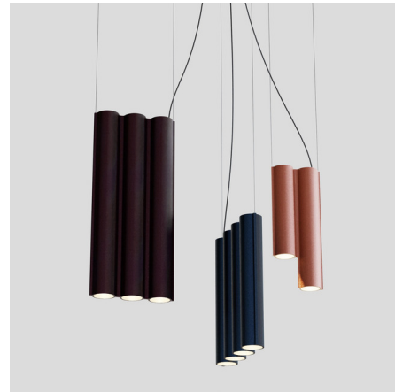
Shown in terracotta / glossy oxblood / midnight blue

The Silo 12 Multi Light Pendant offers a theatrical but sleek look thanks to its array of extruded aluminum cylinders. Silo's curving shape creates a rhythmic expression that adds a contrast to the pendant's rigid aluminum construction. In this composition, multiple pendants are suspended together to create an intriguing display. ELV / 0-10V dimmable.