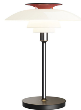
Shown in chrome / red / opal white

LAMP LIFE . . . . . 50000 hours COLOR RENDERING . . . . . 90 CRI LAMP COLOR . . . . . 2700K Warm Dim LUMENS/WATT . . . . . 17.40 LUMINOUS FLUX . . . . . 174 lumens