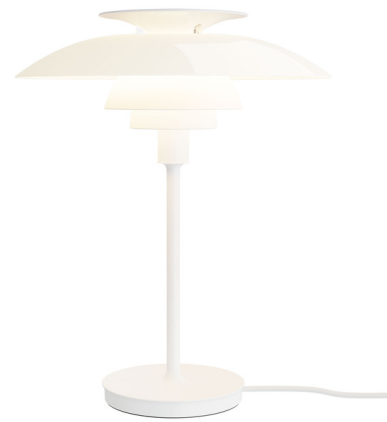
Shown in white / opal white

PRODUCT DIMENSIONS . . . . . Cord Length: 98.4"