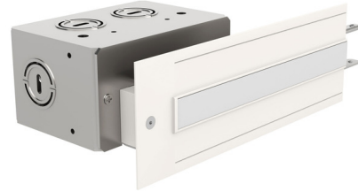
Shown in satin aluminum

TruLine .5A End Feed Power Channel Connector allows 24VDC power to be fed from the end of the channel. LED Soft Strip (not included) may be installed flat or on one side of the channel. Includes Lens, Channel Joiners, Junction Box, Adjustable Mounting Bars, and a 90 Degree Power Connector. Designed for use with PureEdge Lighting RGBW (Red/Blue/Green + White) TruLine .5A plaster-in LED system.