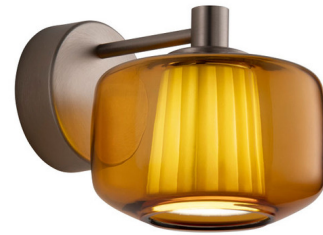
Shown in matte steel / dark amber / light grey plisse

The overlapping shapes and textures of the Plisse Wall Sconce were inspired by the gracefully ethereal form of jellyfish. The rounded blown glass shade houses an inner pleated fabric shade for a unique blend of materials. The sconce is illuminated by an integrated LED for a soft glow perfect for any space. Compatible with Standard 120V (TRIAC) or 0-10V dimmers (dimmers sold separately).