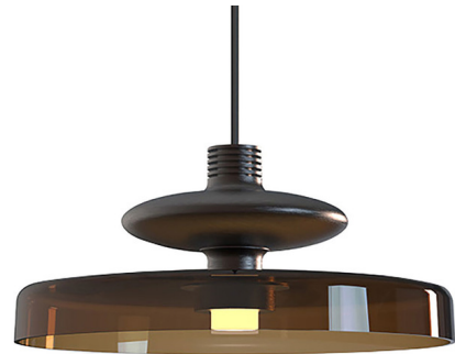
Shown in matte bronze / burned earth

The Tread Wide Pendant offers an industrial vibe with its retro-inspired metal accent and wide glass shade. The finned heatsink atop the pendant is both functional and decorative, recalling the look of vintage electrical equipment. A wide glass diffuser completes the look and helps spread light from the integrated LED.