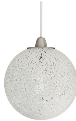
Shown in matte steel / white

The Rina Pendant is inspired by dandelions with its spherical shape and unique lighting effect. The glass is made using a murrine effect, a traditional technique that creates a pattern of translucent white dots and clear spaces. As light passes through the glass, a dazzling pattern of light and shadow is cast upon the pendant's surroundings.