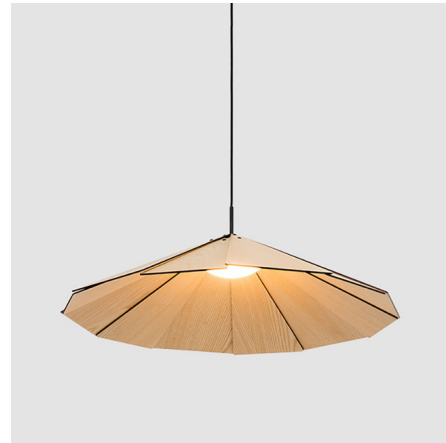
Shown in ash wood / opal

Sepal is a suspension luminaire created with twelve ash wood slats overlapping to resemble a sepal structure. The slats are fixed to the central axis using finishing screws with exposed heads. Light is dissipated evenly thanks to an injected polycarbonate shade which protects the LED. Its natural finish transmits harmony to a space, making it a key piece in warm, relaxed and inviting settings.