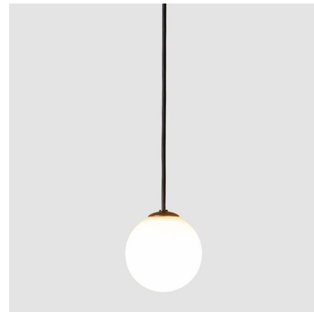
Shown in matte black / opal

Symphony is a collection of suspension and surface lighting solutions that can transport you into a recital with its diffusion of light, now also available as a modular system for added flexibility. The glass lampshade features a magnetization system that creates a magnetic field, allowing the sphere to rotate around the ball joint on the axis. A very flexible and functional luminaire, Symphony allows you to rotate the shade to direct the light as necessary to either dilute it or envelop the atmosphere. The minimalistic and unique design of this collection gives it great mobility, easily adapting to the needs of a space at any given moment and therefore creating a connection between the light and the user.