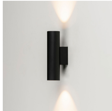
Shown in matte black

Haul is a large family of downlights offered as a single or double spot, surface-mounted, track, suspension, or modular system, direct or indirect lighting; this cylindrical family extends to all options for a complete and functional offering. The simplicity and harmony of this lamp lies in the purity of an extruded steel cylinder with a shining focused light. Note: Includes canopy for U.S. junction box.