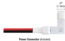
Power Connector (Included)