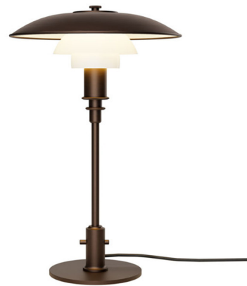
Shown in aged brass / opal

The PH 3/2 Table Lamp, designed by Poul Henningsen, is based on the principle of a reflective three shade system, which directs the majority of the light downwards. The shades are made of hand-blown opal three layer glass, which is glossy on top and sandblasted matte on the underside, giving a soft light distribution. On/Off switch on cord.