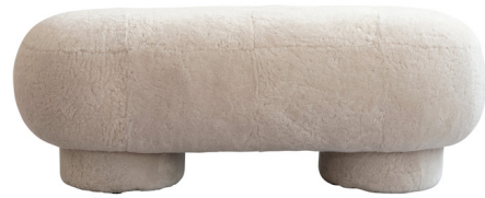
Shown in sand