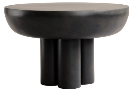
Shown in coffee

The collection of Crown Tables are cast in one piece formed as a circular table top carried by four cylinder shaped legs. Standing strong and proud, the table is inspired by the bare, structural elements of Brutalist architecture, celebrating the columns, and eluding an attitude towards too many details. The chunky fiber concrete legs enable a large gap between the table edge and legs to emphasize the experience of a massive floating table top. The table is available in two sizes and can be used as a single standing side table or stand together as a pair of coffee tables.