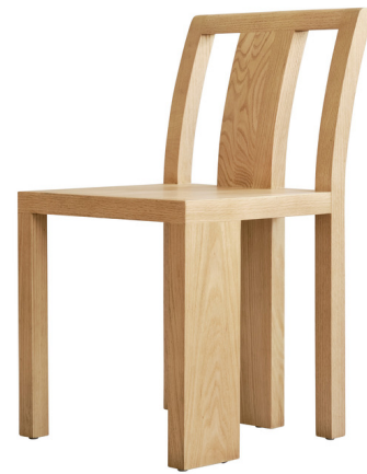
Shown in oak