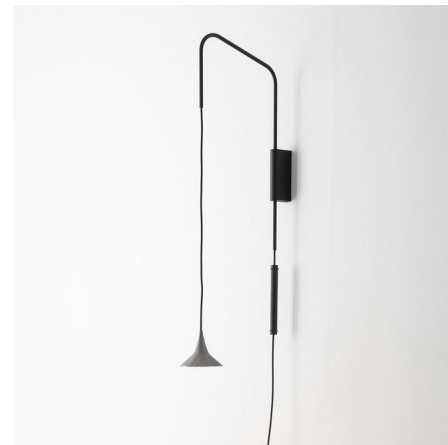
Shown in black / aluminum

PRODUCT DIMENSIONS . . . . . Cord Length: 48" LAMP LIFE . . . . . 105000 hours COLOR RENDERING . . . . . 90 CRI LAMP COLOR . . . . . 3000K LUMENS/WATT . . . . . 52.00 LUMINOUS FLUX . . . . . 416 lumens