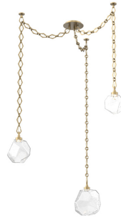
Shown in gilded brass / clear

COLOR RENDERING . . . . . 93 CRI LAMP COLOR . . . . . 3000K LUMENS/WATT . . . . . 236.59 LUMINOUS FLUX . . . . . 1261 lumens