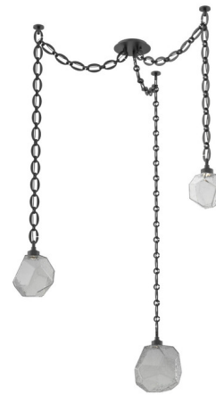
Shown in matte black / smoke

COLOR RENDERING . . . . . 93 CRI LAMP COLOR . . . . . 3000K LUMENS/WATT . . . . . 236.59 LUMINOUS FLUX . . . . . 1261 lumens