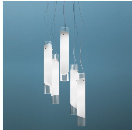
Shown in nickel / white

Lio 5-light Pendant features a satin nickel finish with blown glass lamps created with technique that enables modelling a white glass band into several layers of crystal.