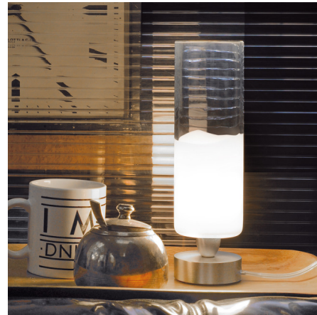
Shown in nickel / white

The Lio Table Lamp features a Satin Nickel base with a blown glass diffuser created with a technique that enables modelling a white glass band into several layers of crystal.