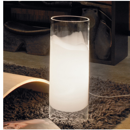
Shown in nickel / white

The Lio Table Lamp features a Satin Nickel base with a blown glass diffuser created with a technique that enables modelling a white glass band into several layers of crystal.