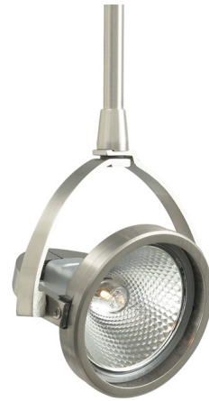
Shown in satin nickel

Combining simplicity with functionality, the John Wall Monorail Head is perfect for residential and commercial applications including galleries and retail stores. Light direction can be precisely adjusted using the 360 degree head rotation and 360 degree pivot. The integrated louver lens holder can hold an eggcrate louver (included) or a glass lens (sold separately). A wall monorail connector is included. Dimmable with an ELV or MLV dimmer, depending on the system transformer. Notes: Requires a 1-circuit wall monorail track system, sold separately. Not compatible with MaxLite 8W MR16 LED bulbs.