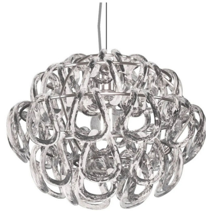
Shown in chrome / transparent

Originally conceived in 1967 by Angelo Mangiarotti, the Giogali Pendant derives both its name and shape from the Italian word giongher, referring to the rope used to tie a horse or ox-driven cart to the yoke. The pendant is composed of a multitude of small, rope-like crystal hooks, which are linked together to form a net of glistening glass. The crystal is draped around the light's frame, obscuring the light source and creating a gleaming cascade of light. With its delicate and glamorous aesthetic, Giogali will enhance any interior with an elegant sparkle. Note: Due to the weight of the fixture, the 25 and 33 inch pendants require additional ceiling support. The 14.5 inch pendant is only available with Black, White, or Transparent shade color and Chrome finish.