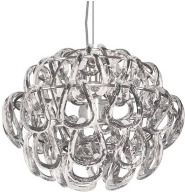
Shown in: Chrome / Transparent

Originally conceived in 1967 by Angelo Mangiarotti, the Giogali Pendant derives both its name and shape from the Italian word giongher, referring to the rope used to tie a horse or ox-driven cart to the yoke. The pendant is composed of a multitude of small, rope-like crystal hooks, which are linked together to form a net of glistening glass. The crystal is draped around the light's frame, obscuring the light source and creating a gleaming cascade of light. With its delicate and glamorous aesthetic, Giogali will enhance any interior with an elegant sparkle. Note: Due to the weight of the fixture, the 25 and 33 inch pendants require additional ceiling support. The 14.5 inch pendant is only available with Black, White, or Transparent shade color and Chrome finish.