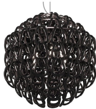
Shown in chrome / black

PRODUCT DIMENSIONS . . . . . Adjustable Cable Length: 79"