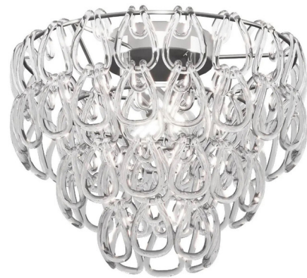
Shown in chrome / transparent

Originally conceived in 1967 by Angelo Mangiarotti, the Minigiogali Ceiling Light derives both its name and shape from the Italian word giongher, referring to the rope used to tie a horse or ox-driven cart to the yoke. The fixture is composed of a multitude of small, rope-like crystal hooks, which are linked together to form a net of glistening glass. The crystal is draped around the light's frame, obscuring the light source and creating a gleaming cascade of light. With its delicate and glamorous aesthetic, Minigiogali will enhance any interior with an elegant sparkle.