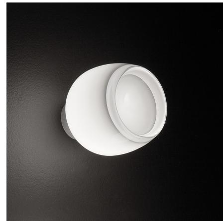
Shown in white / white

The Implode Spot Light represents the illusion of a surface created by the implosion of a volume. The glass, due to its density, reveals the gradations of multiple layers of white crystal and transparent.