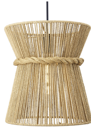
Shown in matte black / natural

The Sutton Pendant is a beautifully crafted geometric pendant in natural materials, accentuated by intricate rope detailing. It merges classic craftsmanship with modern elegance. NOTE: This is a cord hung pendant and includes 120 inch field adjustable cord.